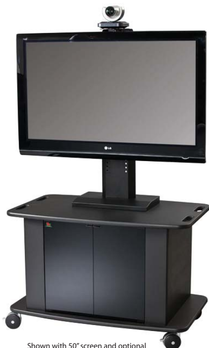
Shown with 50" screen and optional base cover PM-CVR