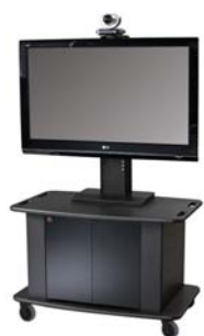
(Shown with mount option)