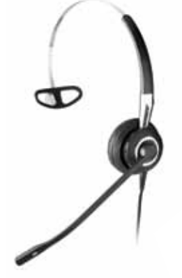
JABRA BIZ™ 2400 MONO

GN Netcom is a world leader in innovative headset solutions. GN Netcom develops, manufactures and markets its products under the Jabra brand name